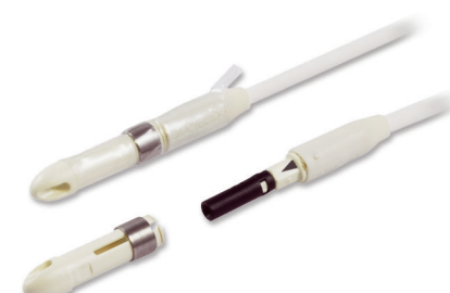
Optional protection cap with pulling eye