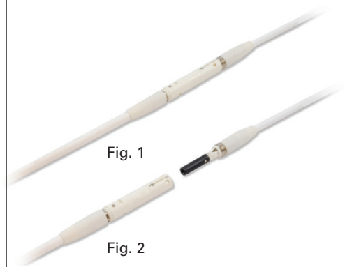
Fig. 1 Connected DiaLink-Saver Fig. 2 Disconnected DiaLink-Saver